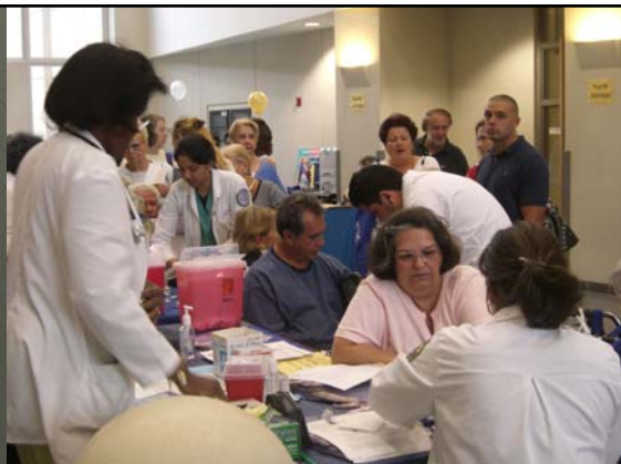
Attendees get their blood checked at the 2008 Boomers and Beyond health fair